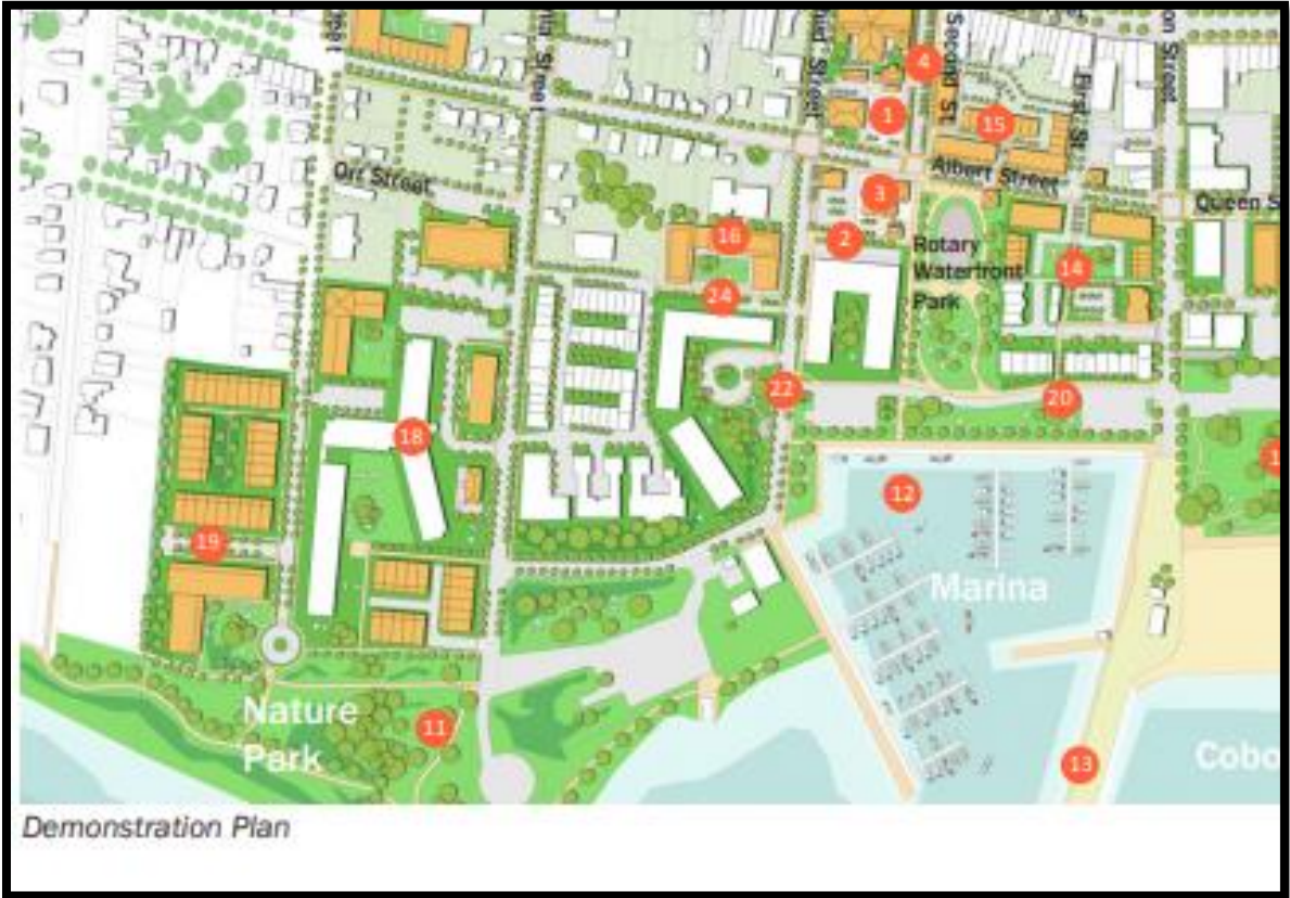
Figure 2: Downtown Master Plan depicting 117 Durham St waterfront public realm/nature park, north section residential - #19 on map above

The Demonstration Plan (See Figure 2) provides a long-term development concept for Downtown Cobourg and is intended as a guide to help direct development based on the Vision.