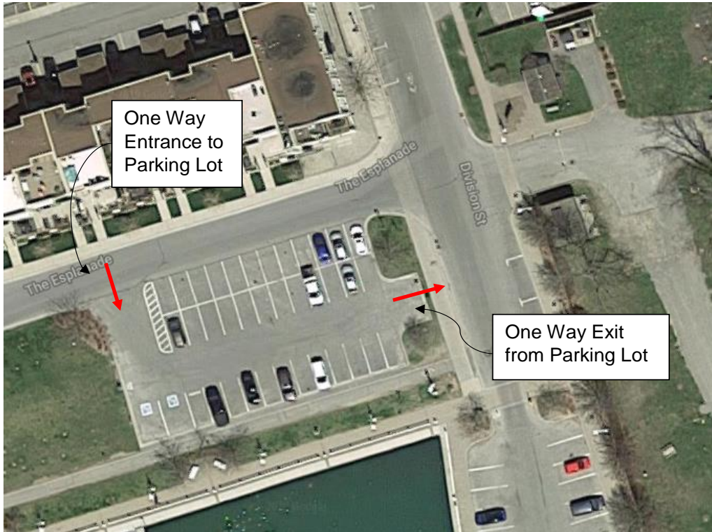
Figure 3: Entrance to parking lot from the Esplanade and exit from parking lot onto Division Street only.